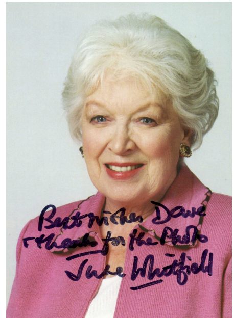
Autographs are weird things..., 2008

Humour has a large part to play in my practice too. The aesthetics of my practice are sometimes wacky and rather childish, in fact whole projects can seem very silly. It's my aim to use humour as a tool for interaction and this approach can help in persuading people to get involved. There are underlying themes in all of my projects though that aims to make people think about how they act towards others. I'm a firm believer that art should be fun, for both me and the audience!